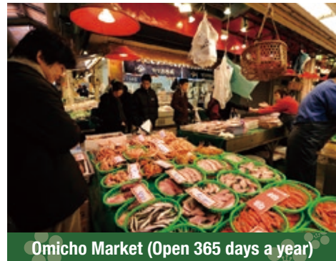
Ohmicho Market (Open 365 days a year)

Kaga vegetables and fishes of the Sea of Japan can be found on the shelves of Ohmicho market. It is crowded with customers ranging from housewives to professional chefs, and has been called "the kitchen of Kanazawa."